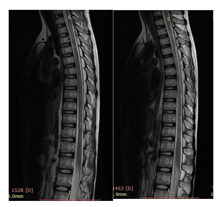
Fig. (3B). B) MRI of the spinal cord, the same girl with NVO Devic, inflammatory lesion on the Th1-Th12 and pronounced atrophy on Th1-Th4 levels in 2020 (1 year 10 months after the debut of NMO).

The results of genotyping for the genes of HLA loci in 21 children with MS (17 females and 4 males) are presented in Table 6. In Table 7, the children with MS are compared with a healthy population of Kazakhs and Russians.