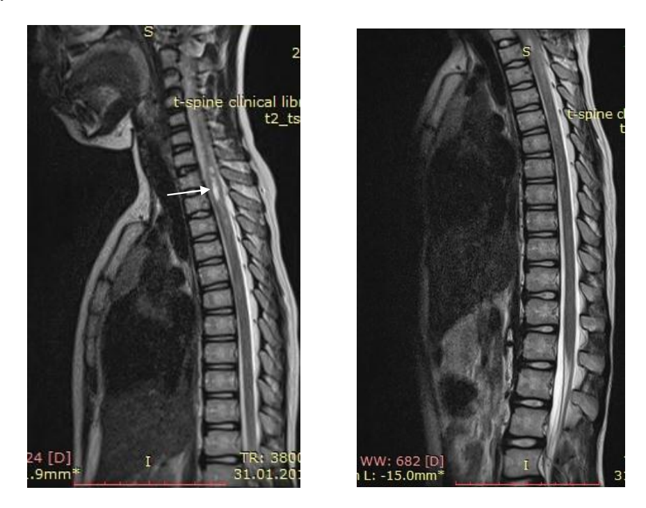
Fig. (3A). A) MRI of the spinal cord, 12-years girl with NVO Devic and inflammatory lesion on the C8-Th1, 2 levels in 2019 at the debut of NMO

The spinal MRI performed in children with NMO showed longitudinal tranversus cervical and thoracic spinal demyelination. In Picture 3 it is shown dynamics of the spinal MRI of girl Zh. B. 2007 year of birth, with progressive loss of vision and spinal cord atrophy and severe paraparesis with urinary incontinence due to the NMO autoimmune necrotic process.